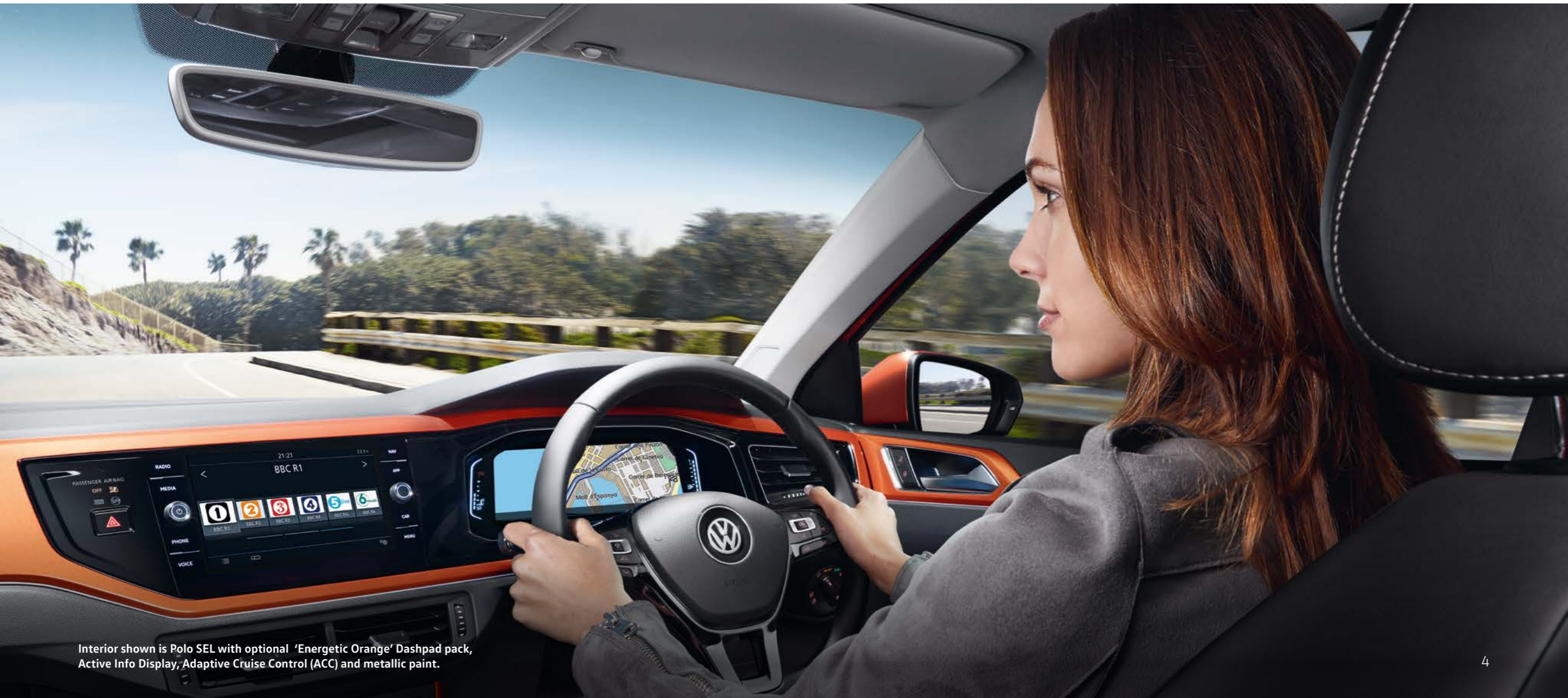
Interior shown is Polo SEL with optional 'Energetic Orange' Dashpad pack, Active Info Display, Adaptive Cruise Control (ACC) and metallic paint.

VWFS UK and Abraxas Insurance Administration Services Limited are authorised and regulated by the FCA. Authorisation details can be checked on the Financial Services Register by visiting fca.org.uk . VWFS UK is not part of the same corporate group as MAPFRE and Abraxas Insurance Administration Service Limited.