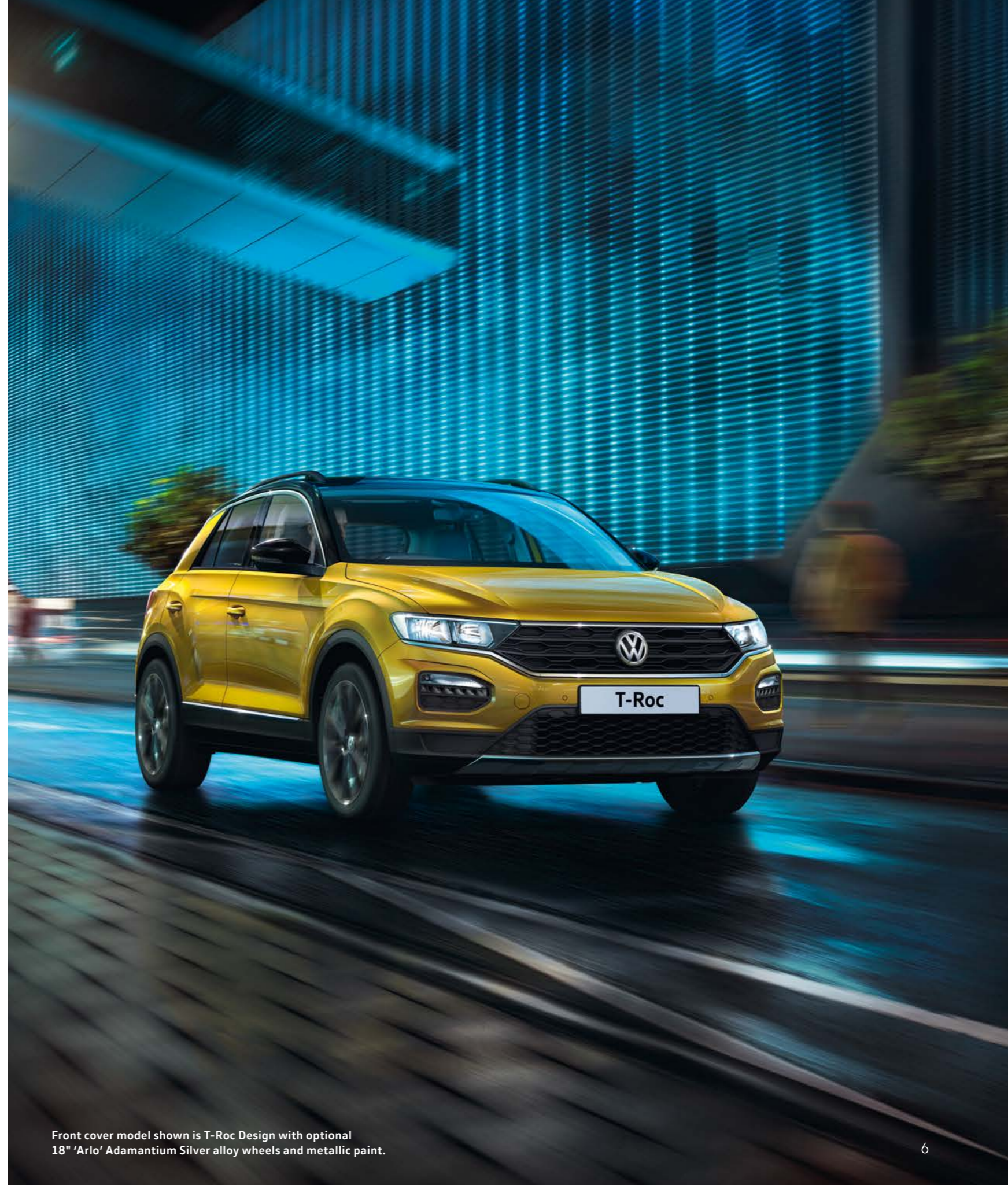
Front cover model shown is T-Roc Design with optional 18" 'Arlo' Adamantium Silver alloy wheels and metallic paint.

Accessories fitted by the Retailer to your vehicle are only covered if specified on the Certificate of Insurance .