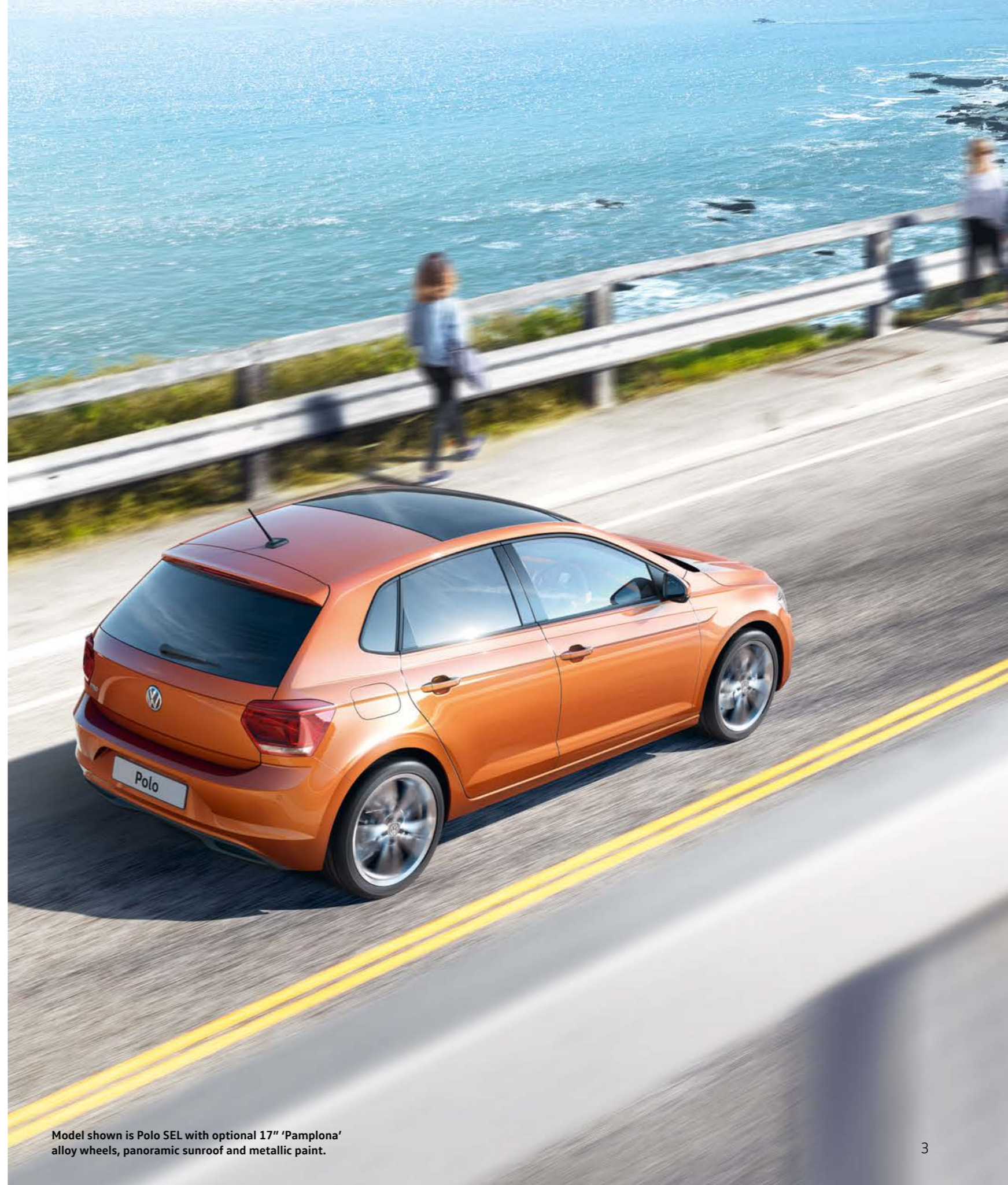
Model shown is Polo SEL with optional 17" 'Pamplona' alloy wheels, panoramic sunroof and metallic paint.

Certain words in this Cover Booklet have a specific meaning. We explain what these words mean under the meaning of words section.