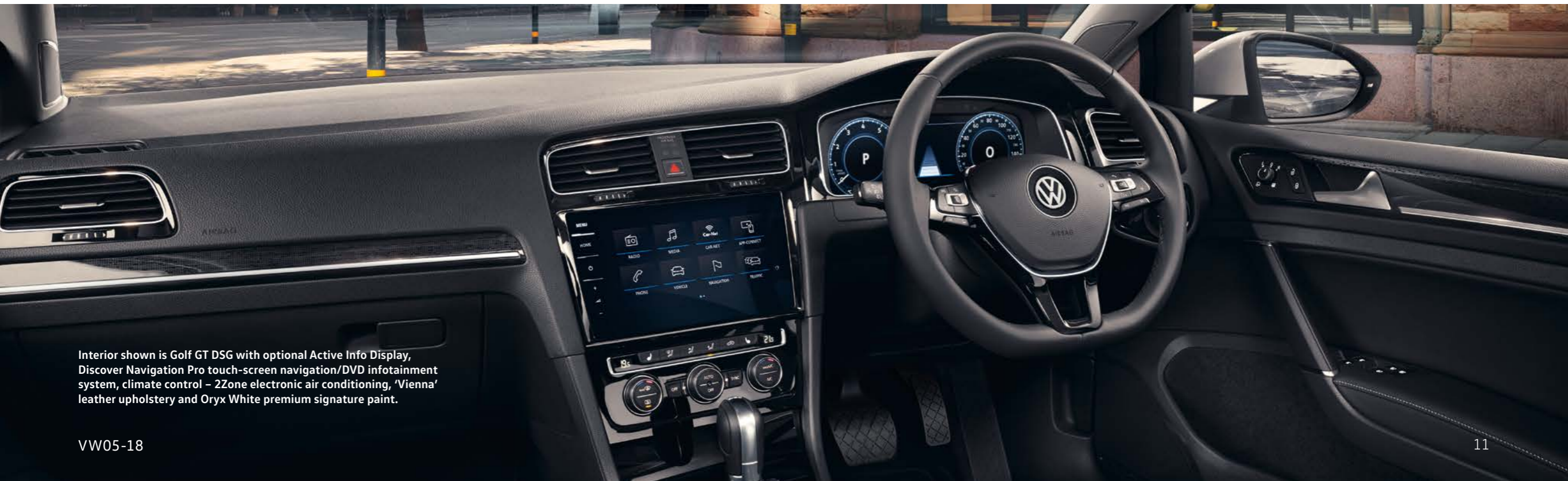
Interior shown is Golf GT DSG with optional Active Info Display, Discover Navigation Pro touch-screen navigation/DVD infotainment system, climate control – 2Zone electronic air conditioning, 'Vienna' leather upholstery and Oryx White premium signature paint.

Further information can be obtained by contacting us, or from the FSCS, telephone number 0800 678 1100 or 020 7741 4100, or by visiting their website at www.fscs.org.uk