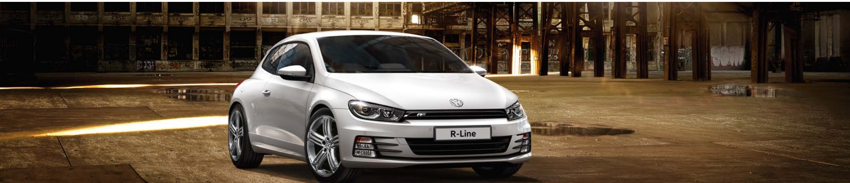
Model shown is Scirocco R-Line with optional Bi-xenon headlights and Pure White non-metallic paint.

Under the Data Protection legislation, the MAPFRE group can only discuss your personal information with you . If you would like anyone else to act on your behalf, please contact us . You can do this by contacting our Data Protection Officer, 1 Victoria Street, Bristol Bridge, Bristol BS1 6AA.