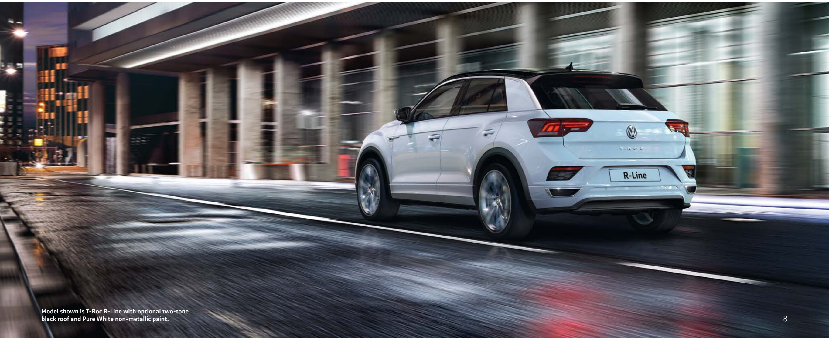
Model shown is T-Roc R-Line with optional two-tone black roof and Pure White non-metallic paint.

We may require additional information or documentation in order to process your claim. If the requested information is not provided within 30 calendar days of reporting a claim then no claim will be paid unless we have agreed an extension, or other exceptional circumstances apply.