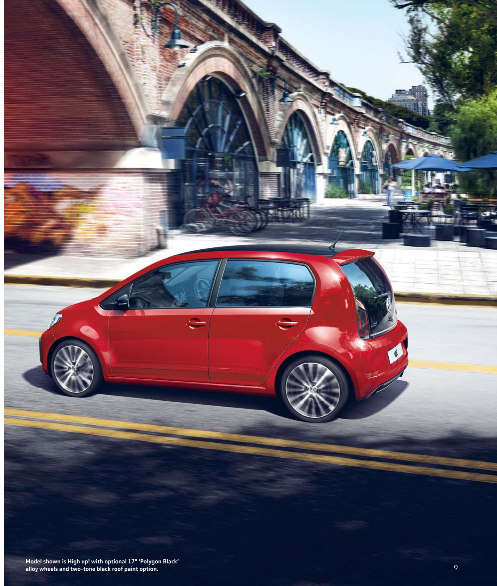
Model shown is High up! with optional 17" 'Polygon Black' alloy wheels and two-tone black roof paint option.