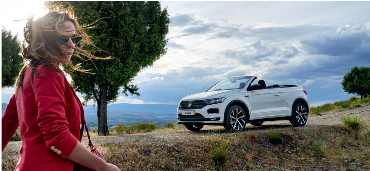
Model shown (above) is T-Roc Cabriolet R-Line with optional 19" 'San Marino' alloy wheels and non-metallic paint. Model shown (right) is new Arteon Shooting Brake R-Line with optional 20" 'Nashville' alloy wheels, Dynamic Chassis Control (DCC), 'IQ. Light' LED headlights, Park Assist and metallic paint.