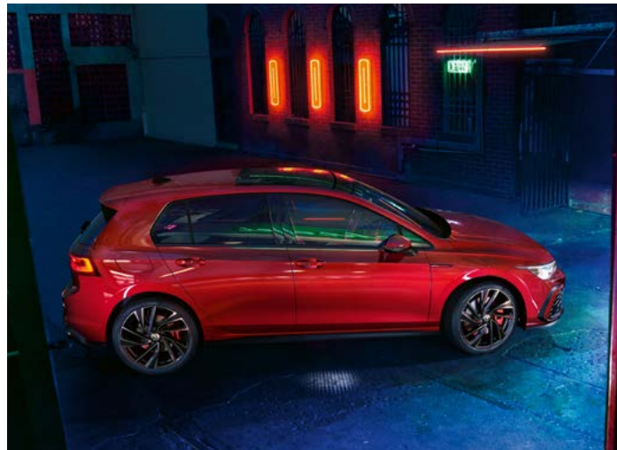
Model shown is new Golf GTI with optional 19" 'Adelaide' Black diamond-turned alloy wheels. 'Vienna' leather upholstery, panoramic sunroof and metallic paint.

The total amount you have agreed to pay us for this insurance policy. If you have not paid your premium , we will not provide cover from the date the premium was due. If the monthly payment option has been chosen and any instalment is not paid your policy will end 30 days after the date the missed instalment was due.