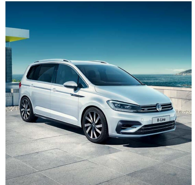
Model shown is Touran R-Line with optional LED premium headlights.

Please allow up to 28 days for your cancellation and refund to be processed.