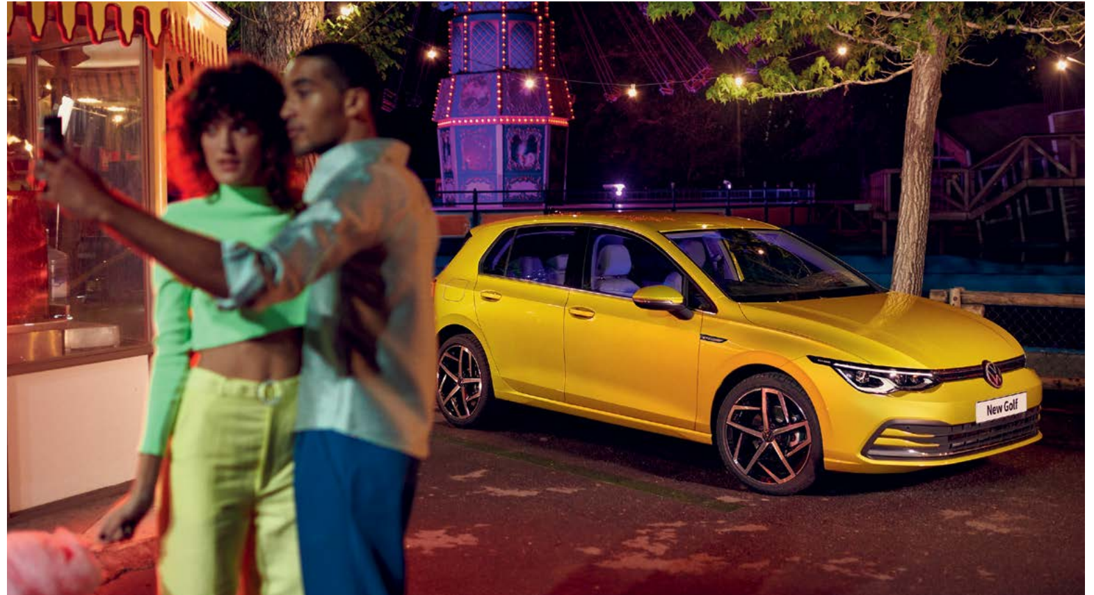
Model shown is new Golf Style with optional 18" 'Dallas' alloy wheels and 'IQ. Light' LED matrix headlights.

The maximum claim limit is based on your vehicle purchase price and is shown in your schedule .