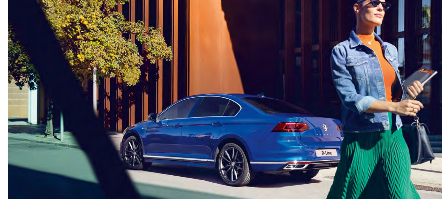
Model shown is Passat R-Line with optional 'IQ. Light' LED matrix headlights, 19" 'Pretoria' Dark Graphite Matt alloy wheels and metallic signature paint.