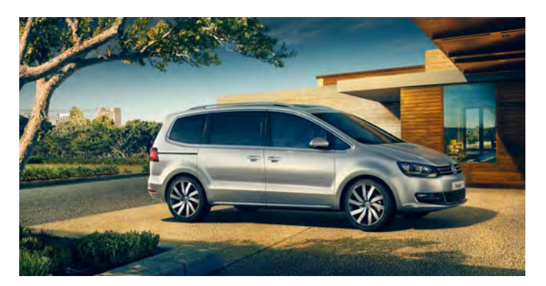
Model shown is Sharan SEL with optional 18" 'Marseille' alloy wheels, Xenon dipped beam headlights and metallic paint.

If you are unable to contact us you may arrange for your vehicle to be repaired. Please contact us at the address below within 30 days of any repair and you will be advised if repairs completed are covered by your warranty. Please ensure that you retain a detailed repair invoice to support your claim. If your claim is covered you will be reimbursed in GBP at the prevailing exchange rate at the time of settlement. Volkswagen Extended Warranty, PO Box 869, Warrington, WA4 6LD.