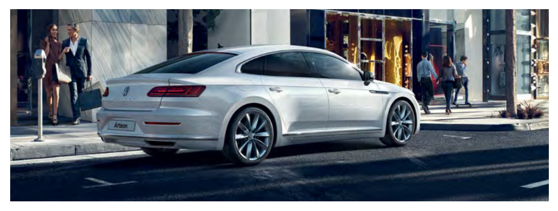
Front cover model shown is T-Roc Design with optional 18" 'Arlo' Adamantium Silver alloy wheels and metallic paint. Model shown on this page is Arteon Elegance 2.0 Itr BiTDI SCR 4MOTION with optional 19" 'Chennai' alloy wheels and Oryx White premium signature paint.