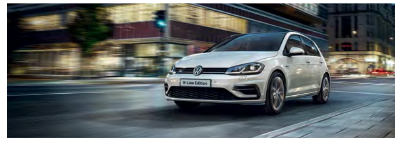
Model shown is Golf R-Line Edition with optional 18" 'Sebring' alloy wheels, panoramic sunroof and Oryx White premium signature paint.