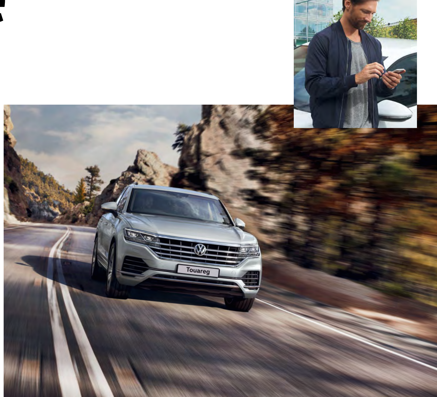
Model shown is Touareg SEL with optional 21" 'Suzuka' Dark Graphite diamond-turned alloy wheels, air suspension, 'IQ. Light' LED matrix headlights, headlight washers and metallic paint.