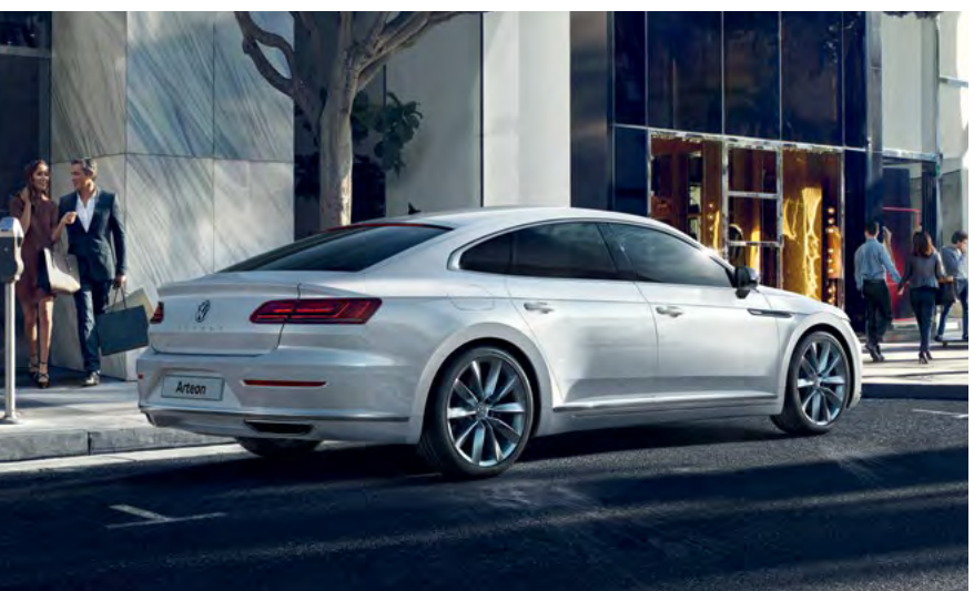
Model shown is Arteon Elegance 2.0 Itr BiTDI SCR 4MOTION with optional 19" 'Chennai' alloy wheels and Oryx White premium signature paint.

Model shown is Passat Estate R-Line with optional 'IQ. Light' LED matrix headlights, 19" 'Pretoria' Dark Graphite Matt alloy wheels, panoramic sunroof and metallic signature paint.