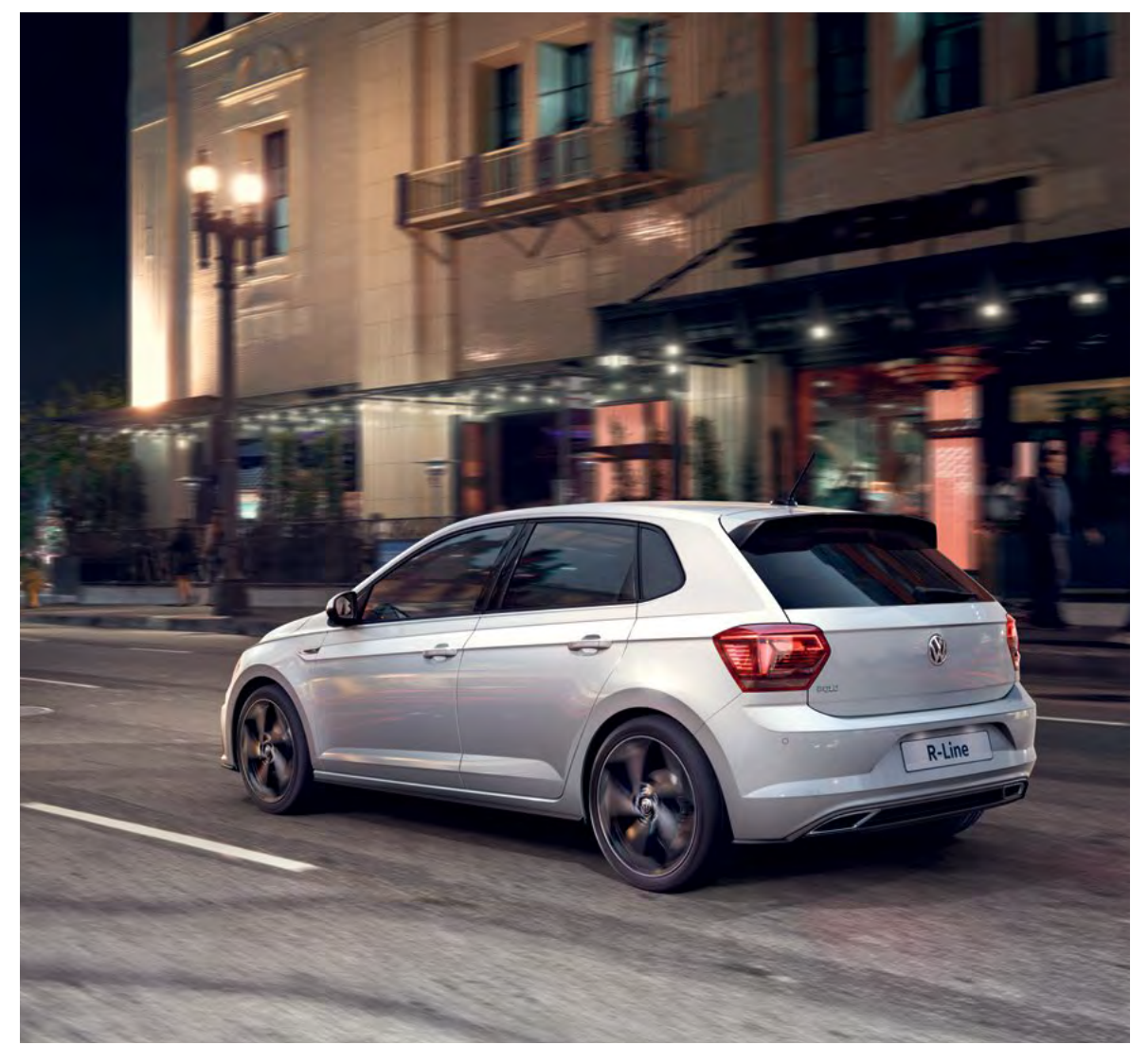
Model shown is Polo R-Line with optional 17" 'Bonneville' Black diamond-turned alloy wheels and metallic paint