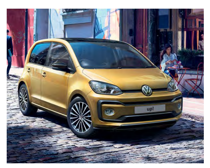
Model shown is High up! with optional 17" 'Polygon Black' alloy wheels, City emergency braking pack and metallic paint with two-tone black roof paint option.