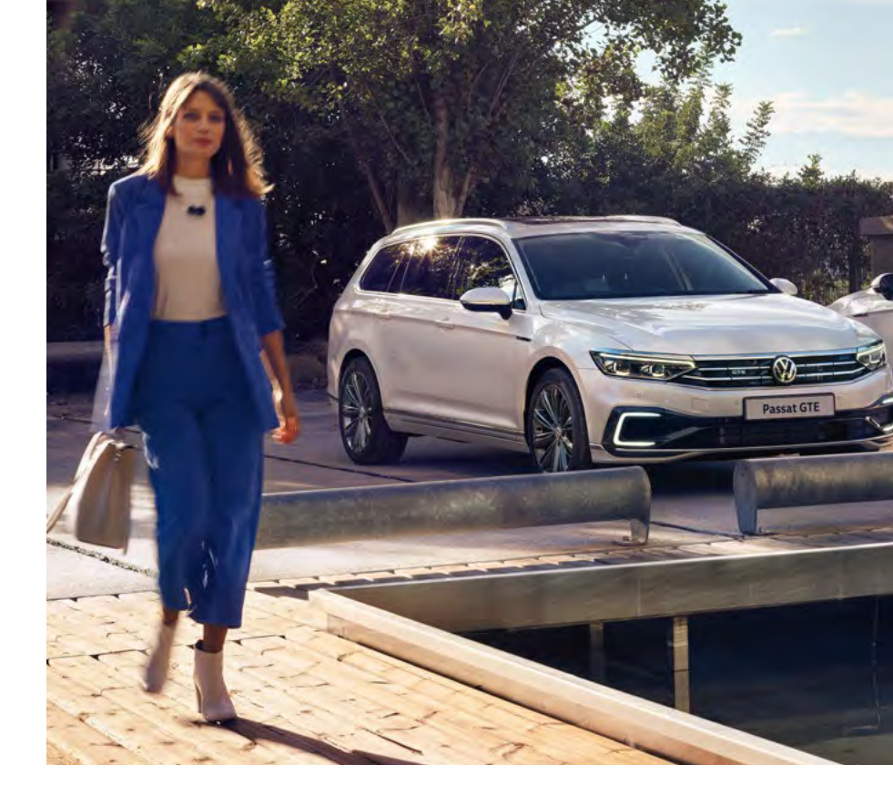
Model shown is Passat Estate GTE with optional 'IQ. Light' LED matrix headlights, panoramic sunroof, Head-up Display and premium signature paint.