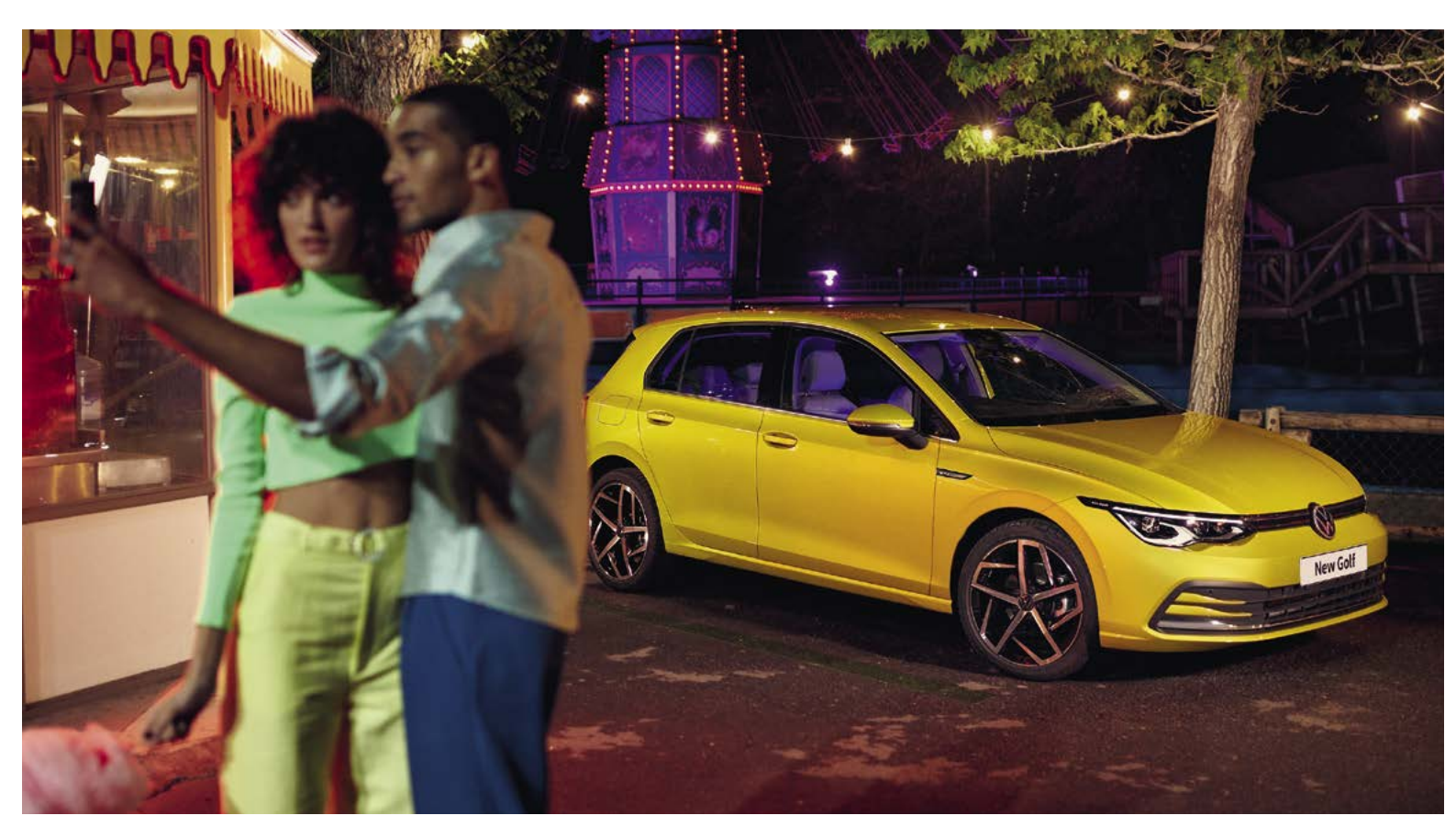
Model shown is new Golf Style with optional 18" 'Dallas' alloy wheels and 'IQ. Light' LED matrix headlights.

The maximum claim limit is based on your vehicle purchase price and is shown in your schedule .