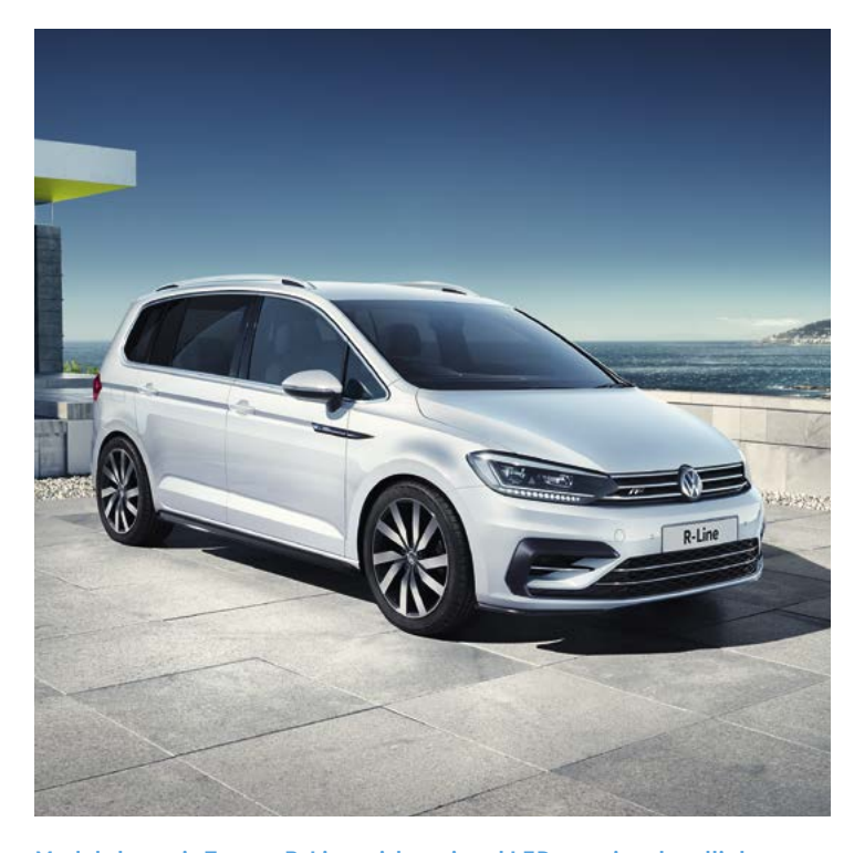
Model shown is Touran R-Line with optional LED premium headlights.

Please allow up to 28 days for your cancellation and refund to be processed.