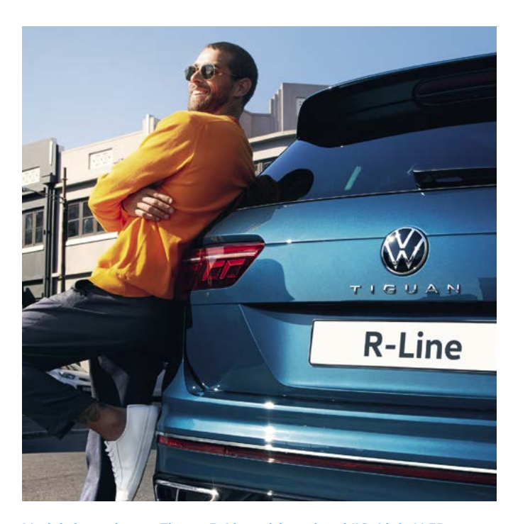
Model shown is new Tiguan R-Line with optional 'IQ. Light' LED headlights and metallic paint.

Whenever the following words or expressions appear in your policy, they have the meaning given below. For ease of reference, defined words or expressions in your policy are shown in bold type.