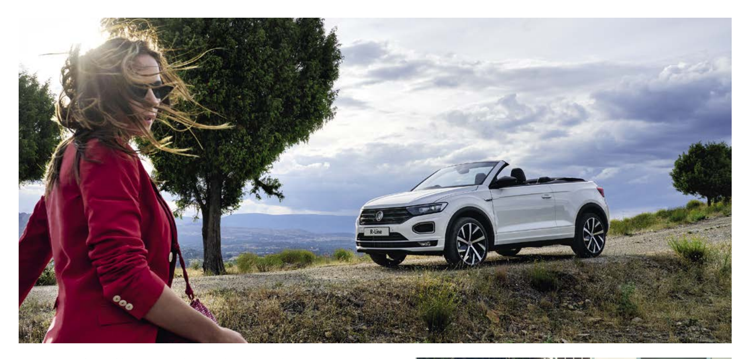
Model shown (above) is T-Roc Cabriolet R-Line with optional 19" 'San Marino' alloy wheels and non-metallic paint. Model shown (right) is new Arteon Shooting Brake R-Line with optional 20" 'Nashville' alloy wheels, Dynamic Chassis Control (DCC), 'IQ. Light' LED headlights, Park Assist and metallic paint.