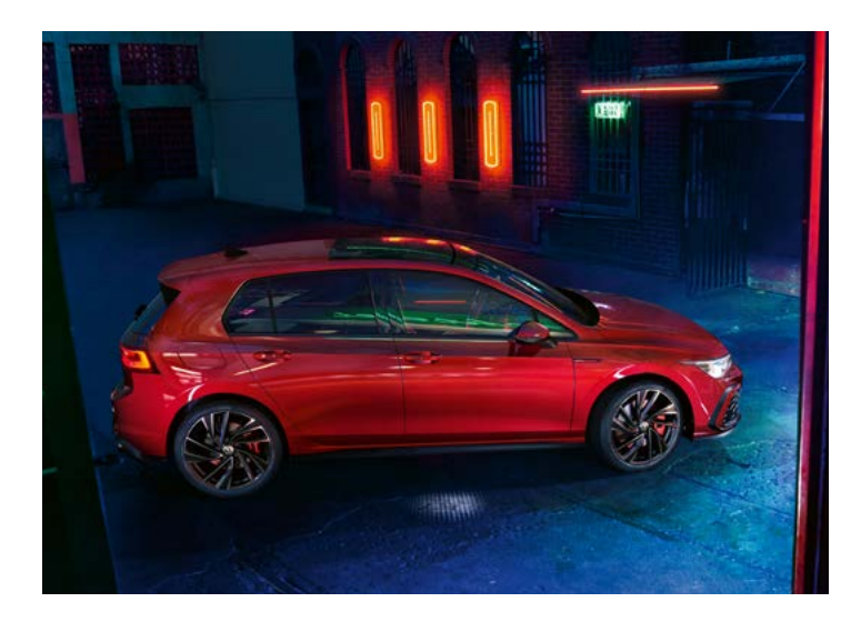
Model shown is new Golf GTI with optional 19" 'Adelaide' Black diamond-turned alloy wheels. 'Vienna' leather upholstery, panoramic sunroof and metallic paint.

The total amount you have agreed to pay us for this insurance policy. If you have not paid your premium , we will not provide cover from the date the premium was due. If the monthly payment option has been chosen and any instalment is not paid your policy will end 30 days after the date the missed instalment was due.