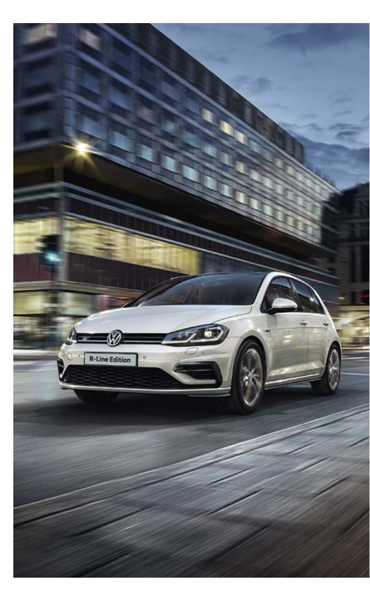
Model shown is Golf R-Line Edition with optional 18" 'Sebring' alloy wheels, panoramic sunroof and Oryx White premium signature paint.