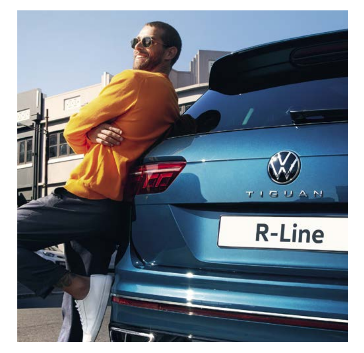
Model shown is new Tiguan R-Line with optional 'IQ. Light' LED headlights and metallic paint.

Whenever the following words or expressions appear in your policy, they have the meaning given below. For ease of reference, defined words or expressions in your policy are shown in bold type.