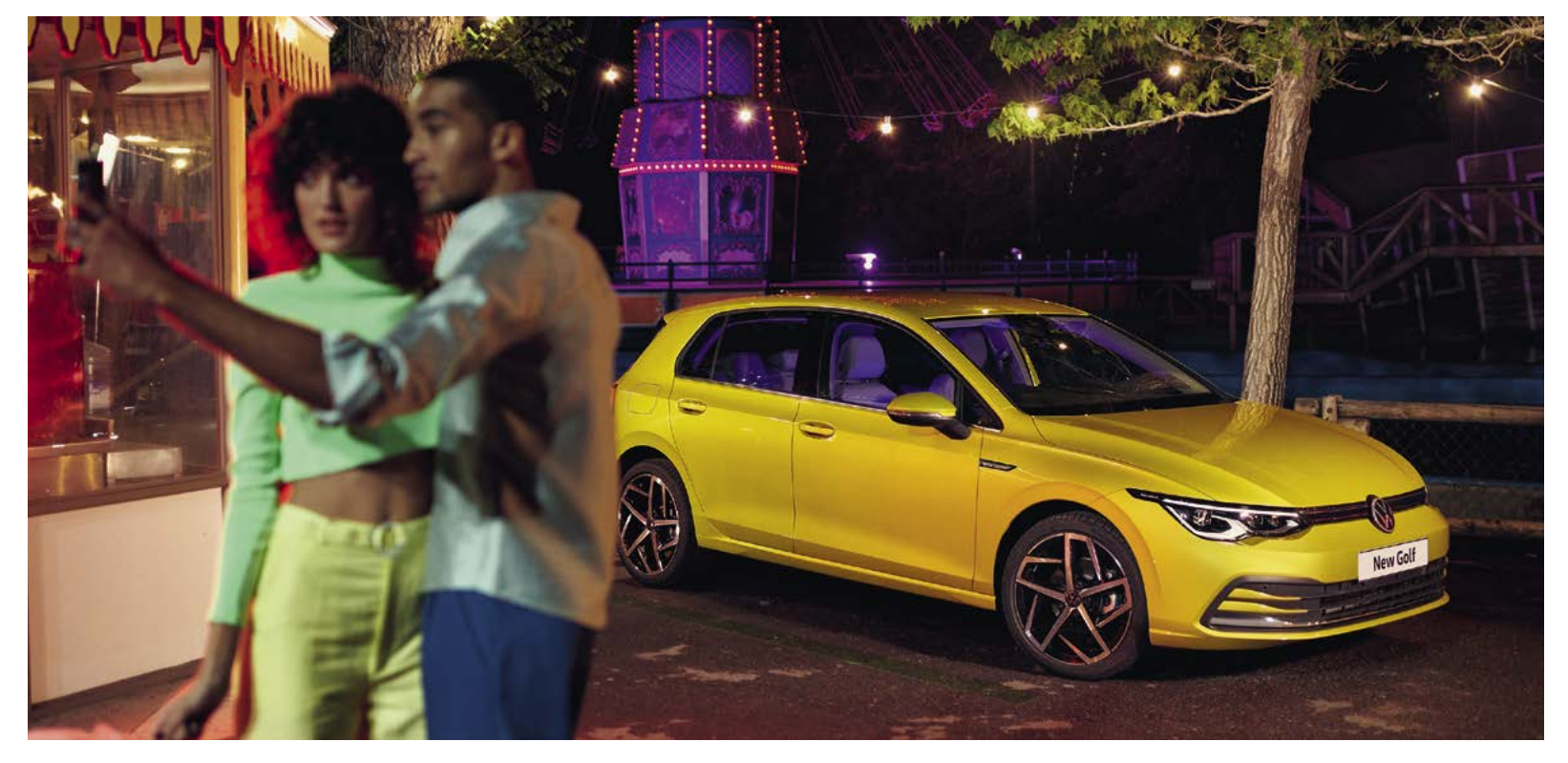
Model shown is new Golf Style with optional 18" 'Dallas' alloy wheels and 'IQ. Light' LED matrix headlights.

The maximum claim limit is based on your vehicle purchase price and is shown in your schedule.