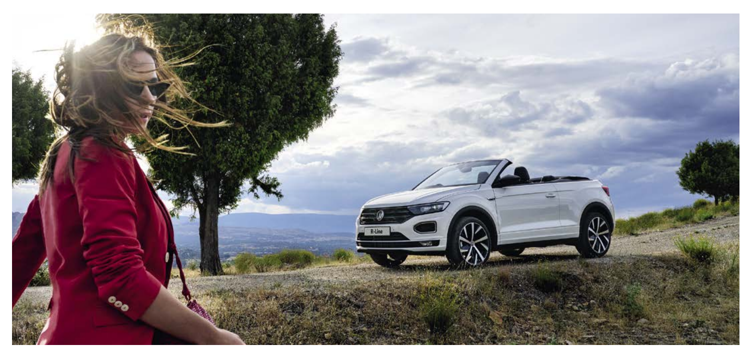
Model shown (above) is T-Roc Cabriolet R-Line with optional 19" 'San Marino' alloy wheels and non-metallic paint. Model shown (right) is new Arteon Shooting Brake R-Line with optional 20" 'Nashville' alloy wheels, Dynamic Chassis Control (DCC), 'IQ. Light' LED headlights, Park Assist and metallic paint.