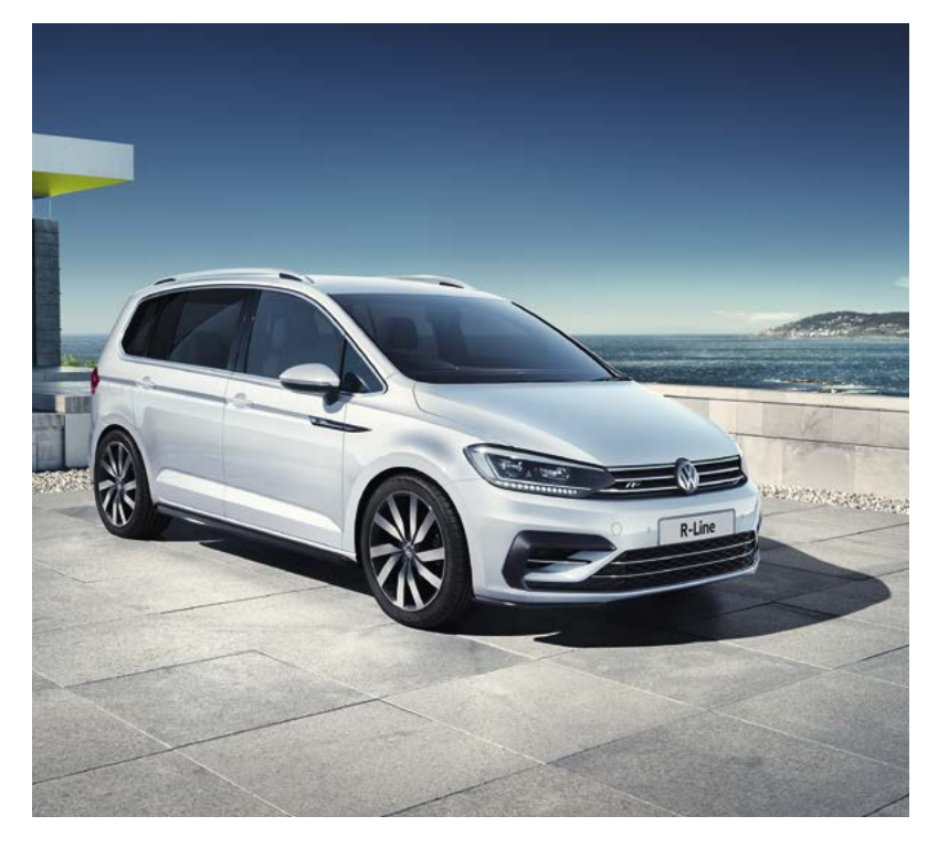
Model shown is Touran R-Line with optional LED premium headlights.

2. If the refund you are eligible for is less than the total outstanding instalment payments you owe Car Care Plan Limited, the refund will be applied as part-payment of your total outstanding instalment payments. You will continue to be responsible for paying the remaining outstanding payments on your instalment agreement with Car Care Plan Limited until the balance calculated at the time of notice of cancellation received by the Administrator has been settled.