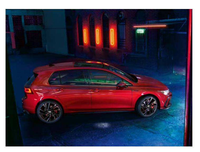
Model shown is new Golf GTI with optional 19" 'Adelaide' Black diamond-turned alloy wheels. 'Vienna' leather upholstery, panoramic sunroof and metallic paint.

The total amount you have agreed to pay us for this insurance policy. If you have not paid your premium , we will not provide cover from the date the premium was due. If the monthly payment option has been chosen and any instalment is not paid, your policy will end 30 days after the date the missed instalment was due.