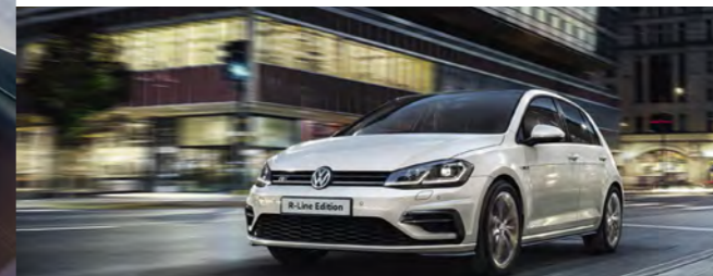
Model shown is Golf R-Line Edition with optional 18" 'Sebring' alloy wheels, panoramic sunroof and Oryx White premium signature paint.