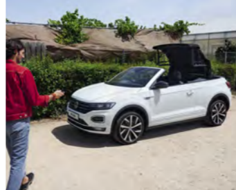
Model shown is T-Roc Cabriolet R-Line with optional 19" 'San Marino' alloy wheels and non-metallic paint.

The Administrator may, in your name, take over and deal with a claim to try to recover from others any money the Administrator has paid out under this policy. At all times you must give the Administrator whatever help it needs.