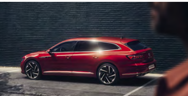
Model shown is new Arteon Shooting Brake R-Line with optional 20" 'Nashville' alloy wheels, Dynamic Chassis Control (DCC), 'IQ. Light' LED headlights, Park Assist and metallic paint.

You can also email us at complaints@insurance-volkswagen.co.uk