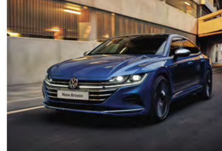
Model shown is new Arteon Elegance with optional 20" 'Rosario Dark Graphite' matt alloy wheels, Dynamic Chassis Control (DCC), 'IQ. Light' LED headlights, sunroof, Assistance Pack Plus, rear tinted glass and metallic paint.

An authorised United Kingdom finance company with whom you have a finance agreement in respect of your vehicle .