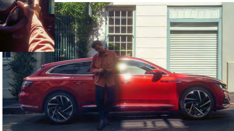
Front cover model shown is new Tiguan R-Line with optional 'IQ. Light' LED headlights and metallic paint. Model shown on this page is new Arteon Shooting Brake R-Line with optional 20" 'Nashville' alloy wheels, Dynamic Chassis Control (DCC), 'IQ. Light' LED headlights, Park Assist and metallic paint.