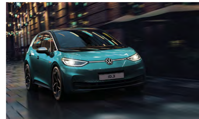
Model shown is ID.3 1 st Edition

Please also take a couple of minutes to check the details we hold for you on your schedule and tell us immediately if there are any mistakes.