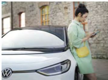
Models shown (above) are T-Roc SEL with optional two-tone black roof and metallic paint and T-Roc Design with optional 18" 'Arlo' Sterling Silver alloy wheels and metallic paint.