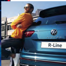
Model shown (far left) is new Golf GTI with optional 19" 'Adelaide' Black diamond-turned alloy wheels. 'Vienna' leather upholstery, panoramic sunroof and metallic paint. Model shown (left) is new Tiguan R-Line with optional 'IQ. Light' LED headlights and metallic paint.