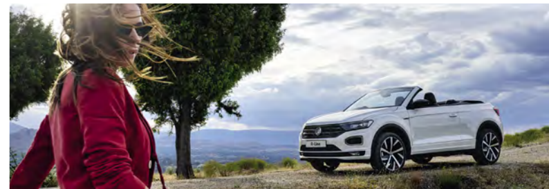
Model shown is T-Roc Cabriolet R-Line with optional 19" 'San Marino' alloy wheels and non-metallic paint.