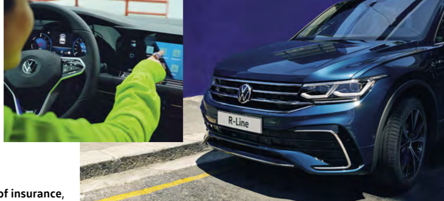
Model shown (above) is new Tiguan R-Line with optional 'IQ. Light' LED headlights and metallic paint.

Following the total loss of your vehicle during the period of insurance , we will pay the difference between the insured value and the purchase price of your vehicle if you have purchased your vehicle outright or with a finance agreement .