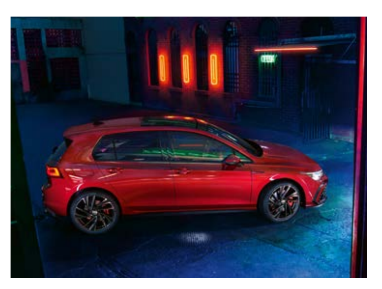
Model shown is new Golf GTI with optional 19" 'Adelaide' Black diamond-turned alloy wheels. 'Vienna' leather upholstery, panoramic sunroof and metallic paint.

The total amount you have agreed to pay us for this insurance policy. If you have not paid your premium , we will not provide cover from the date the premium was due. If the monthly payment option has been chosen and any instalment is not paid, your policy will end 30 days after the date the missed instalment was due.