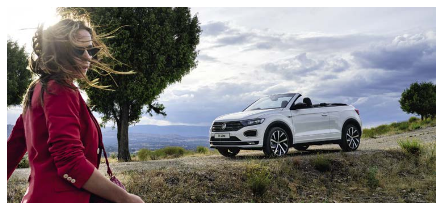
Model shown (above) is T-Roc Cabriolet R-Line with optional 19" 'San Marino' alloy wheels and non-metallic paint. Model shown (right) is new Arteon Shooting Brake R-Line with optional 20" 'Nashville' alloy wheels, Dynamic Chassis Control (DCC), 'IQ. Light' LED headlights, Park Assist and metallic paint.