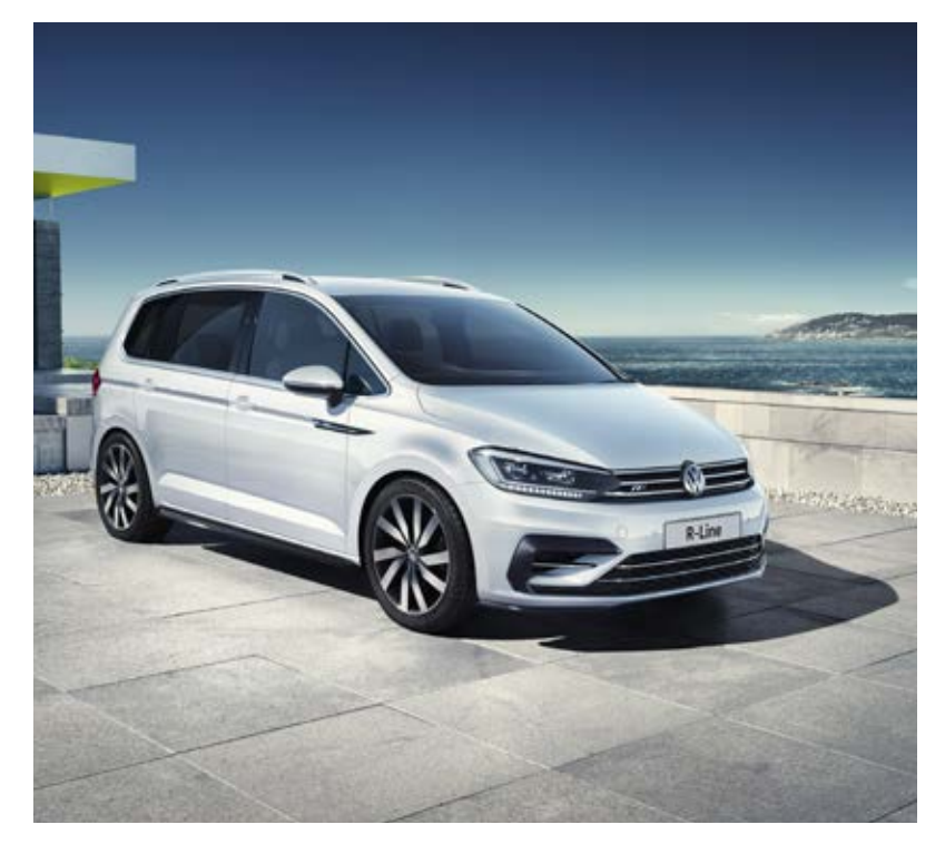
Model shown is Touran R-Line with optional LED premium headlights.

2. If the refund you are eligible for is less than the total outstanding instalment payments you owe Car Care Plan Limited, the refund will be applied as part-payment of your total outstanding instalment payments. You will continue to be responsible for paying the remaining outstanding payments on your instalment agreement with Car Care Plan Limited until the balance calculated at the time of notice of cancellation received by the Administrator has been settled.