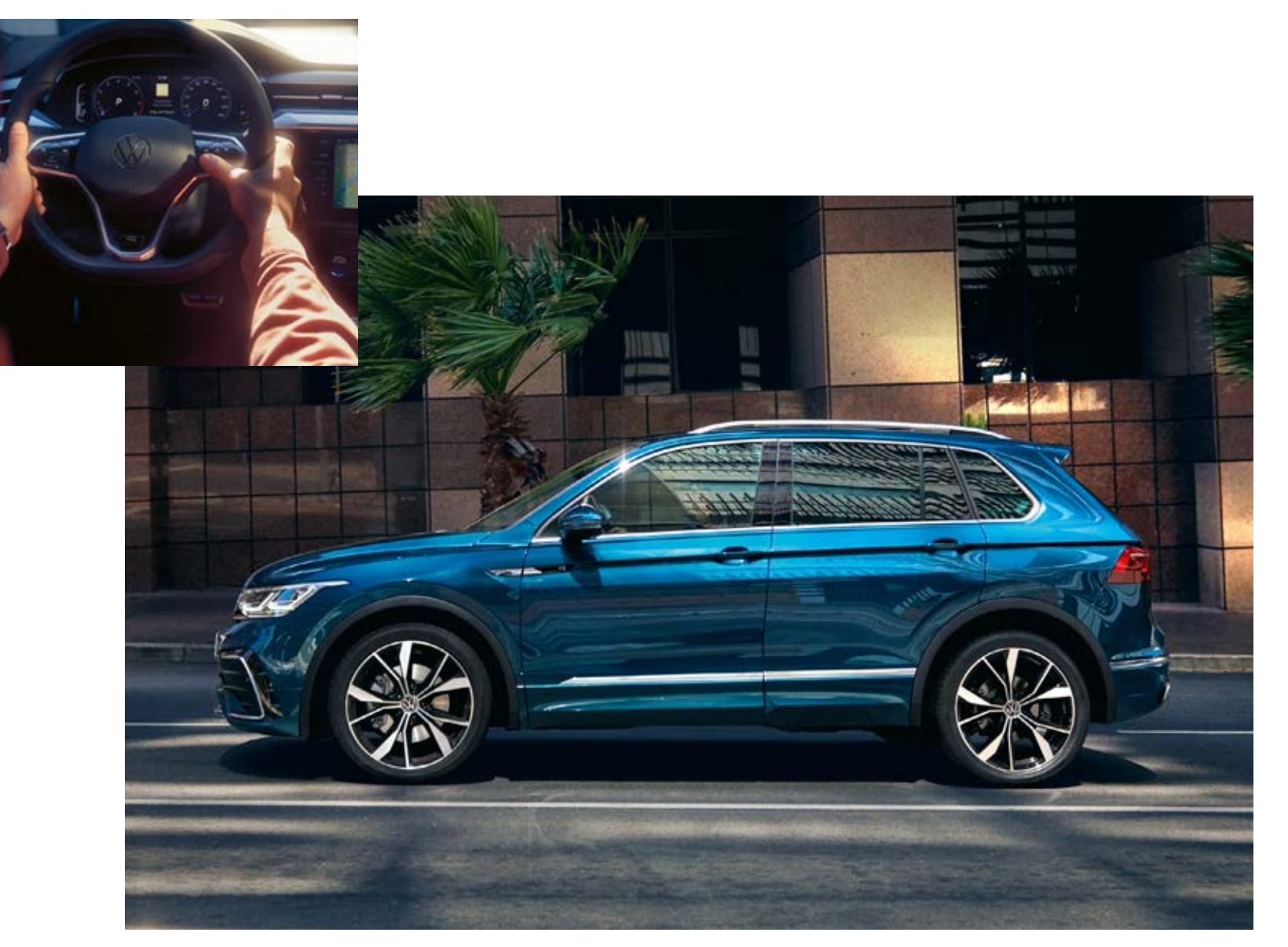
Front cover model shown is new Arteon Shooting Brake R-Line with optional 20" 'Nashville' alloy wheels, Dynamic Chassis Control (DCC), 'IQ. Light' LED headlights, Park Assist and metallic paint. Model shown on this page is new Tiguan R-Line with optional 'IQ. Light' LED headlights and metallic paint.