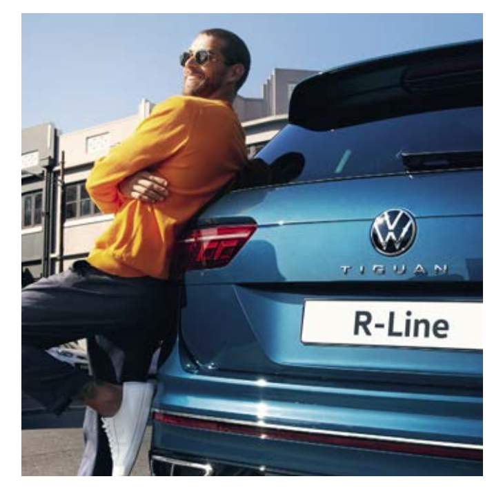
Model shown is new Tiguan R-Line with optional 'IQ. Light' LED headlights and metallic paint.

Whenever the following words or expressions appear in your policy, they have the meaning given below. For ease of reference, defined words or expressions in your policy are shown in bold type.